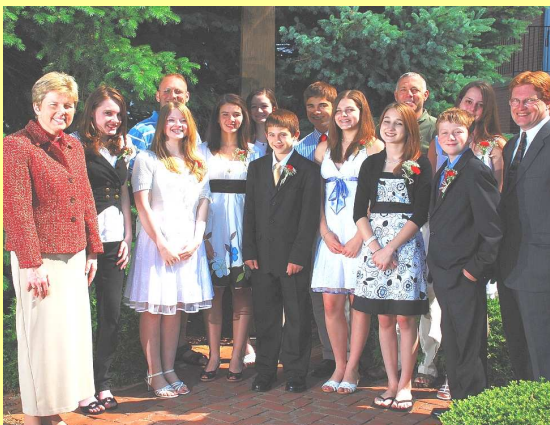
Congratulations to our Ninth Grade Confirmands

Watch for more information about a learning opportunity that relates to those times you find yourself in the midst of change and transition.